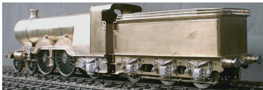
Photo. The G.N.R. production prototype

For R-T-R a 10% deposit will be required on order, a provisional completion date will be given and payment schedule. Preferred Loco name, number and livery will be requested when order placed.